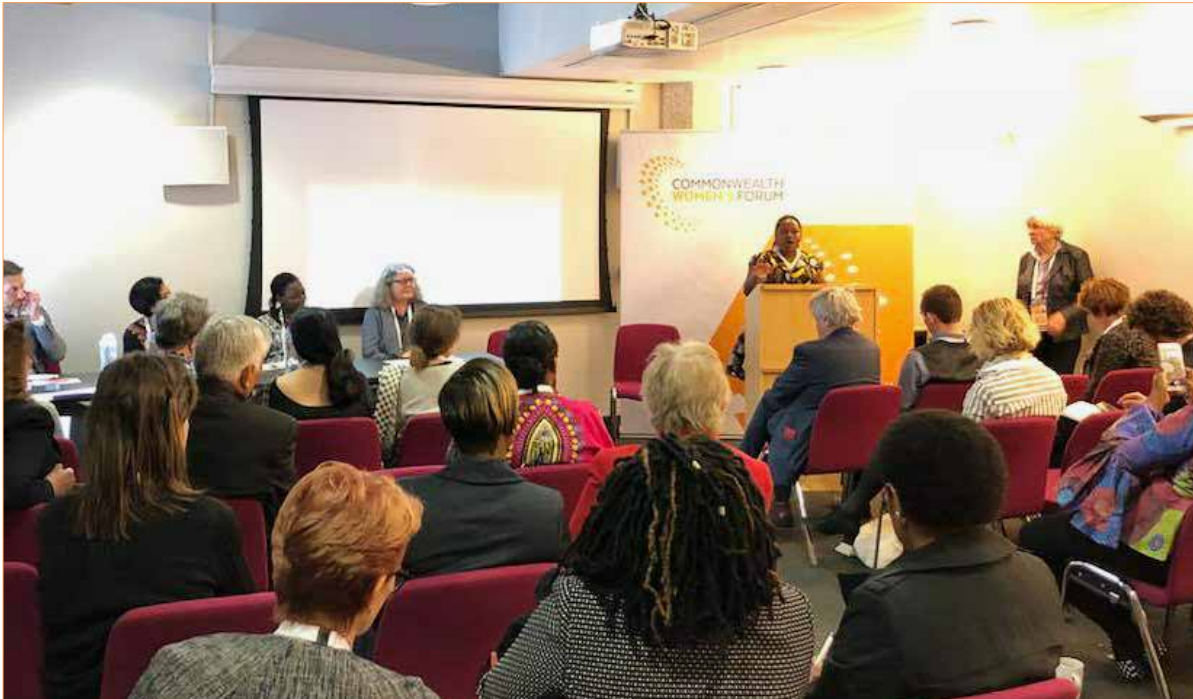
Parallel Session on 'Addressing Barriers to Empowerment' on Day Three of the Women's Forum

National Plan to Reduce Violence Against Women and their Children 2010-2022 (the National Plan). Another initiative aimed at the reduction of violence against women and children is the national prevention campaign: 'Stop it at the start'. The campaign's goal is to illuminate how disrespectful and aggressive attitudes by young men towards young women and girls may lead to VAWG. It encourages conversations about respect between boys and girls, and seeks to end the cycle of domestic violence. Such attitudinal change programmes should be accompanied by effective implementation of legislation, training provided to frontline workers, and an increased number of women in leadership positions to realise change favourably.