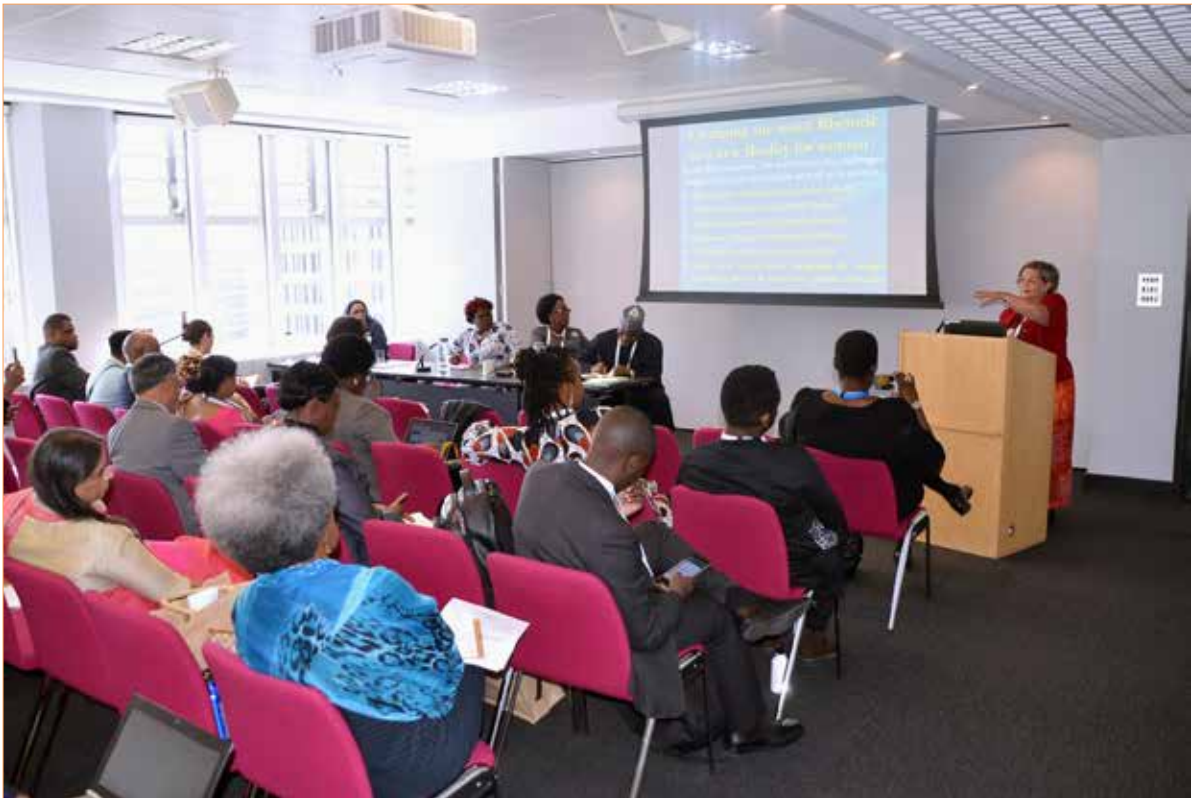
Parallel Session on Leadership and Empowerment on Day One of the Women's Forum

harassment, verbal attacks, trolls and stalking aimed at dissuading women from participating in politics. Furthermore, discriminatory party structures results in men considering women to be a threat rather than an asset. When such behaviours become normalised, female politicians face unique risks. Such acts should be abhorred, as they are callous, cruel and undemocratic. Essentially, creative energies should be employed to muster the might of the media, and seek ways to stem the tide of VAWIE. When a woman freely participates, the nation undoubtedly prospers.