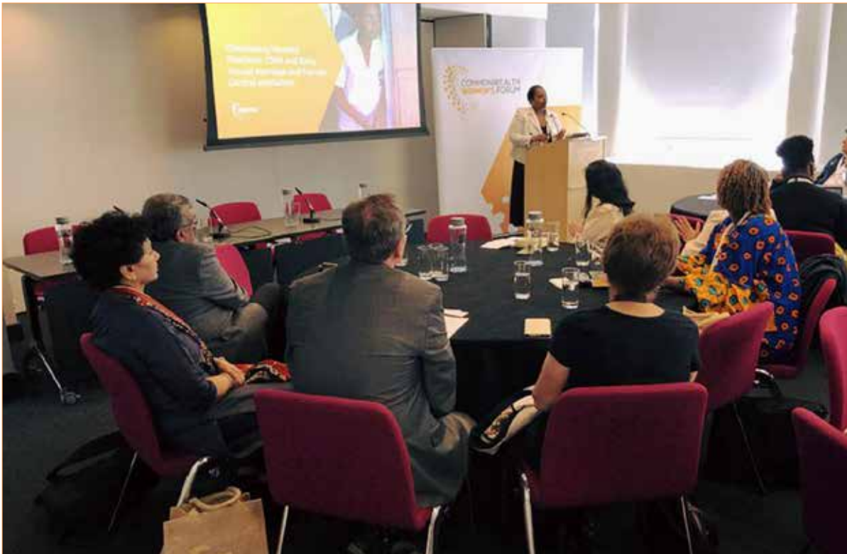
Parallel Session on 'The Environment That Empowers' on Day Two of the Women's Forum