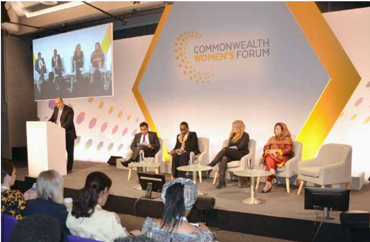
l-r: Andre J Groenewald-South Africa, Lord Ahmad of Wimbledon-UK, Mme Bineta Diop-AU, Hilde Frafjord Johnson-Norway and Mossarat Qadeem-Pakistan at the 'Promoting Women's Mediation Across the Commonwealth' plenary session

the community. Moreover, women's role begins long before conflict erupts. Bringing more women into governance and leadership recognises the important role women and girls play in conflict prevention. In the African Union, there is parity in leadership. With women in governments, gender sensitive budgeting has proved effective in allocating resources for social development (health and education). In the Democratic Republic of Congo's peace negotiations in Sun City, South Africa in 2003, President Masire, former President of Botswana, ensured 12 per cent of negotiators were women. In order to achieve lasting peace agreements, it should be mandatory to involve women, and peace-building efforts should be gender-responsive. Mme Diop concluded that mediation is about peace and justice, and restoring the dignity of women and girls.