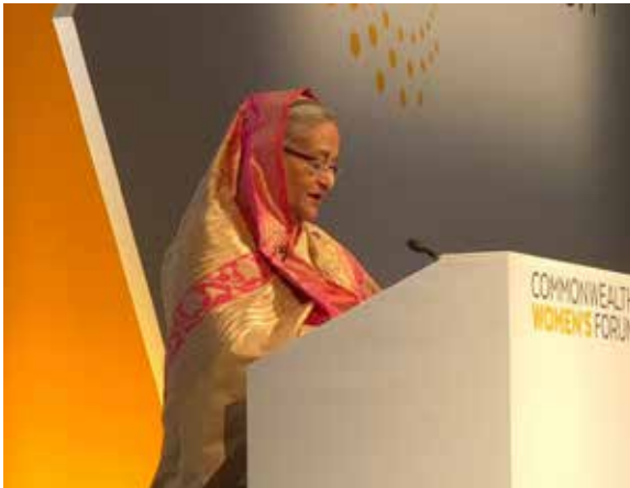
Rt Hon Sheikh Hasina, Prime Minister of Bangladesh at the Educate to Empower Session

commitment to provide free high school education, and to be part of this great programme aimed at promoting education for the girl-child.