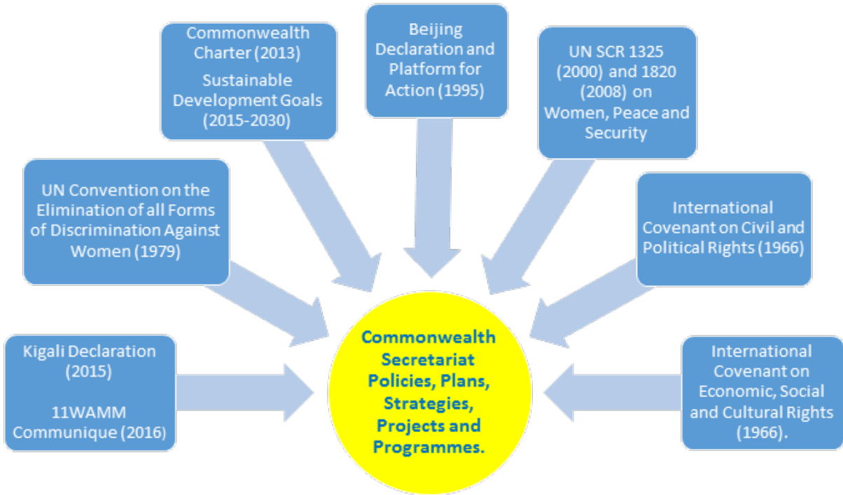
Figure 1: Guiding Commitments, Principles and Values relating to Gender Equality