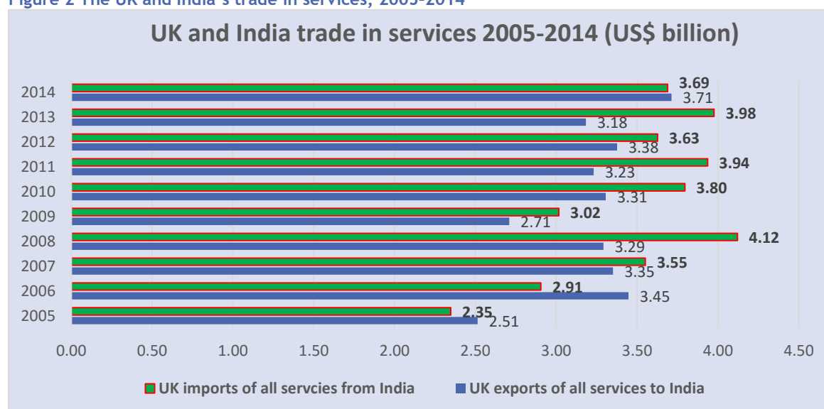
Figure 2 The UK and India's trade in services, 2005-2014

Source: TRADE MAP, International Trade Centre (ITC)